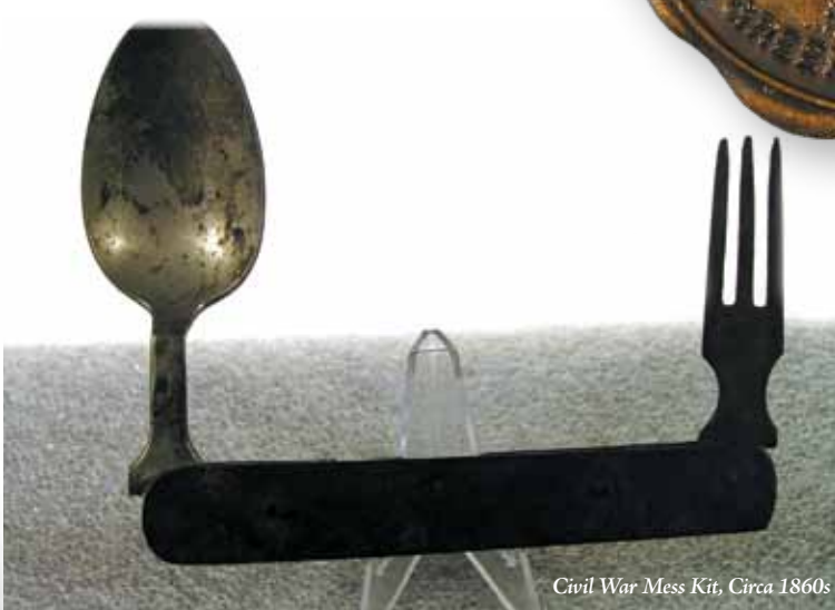
Civil War Mess Kit, Circa 1860s