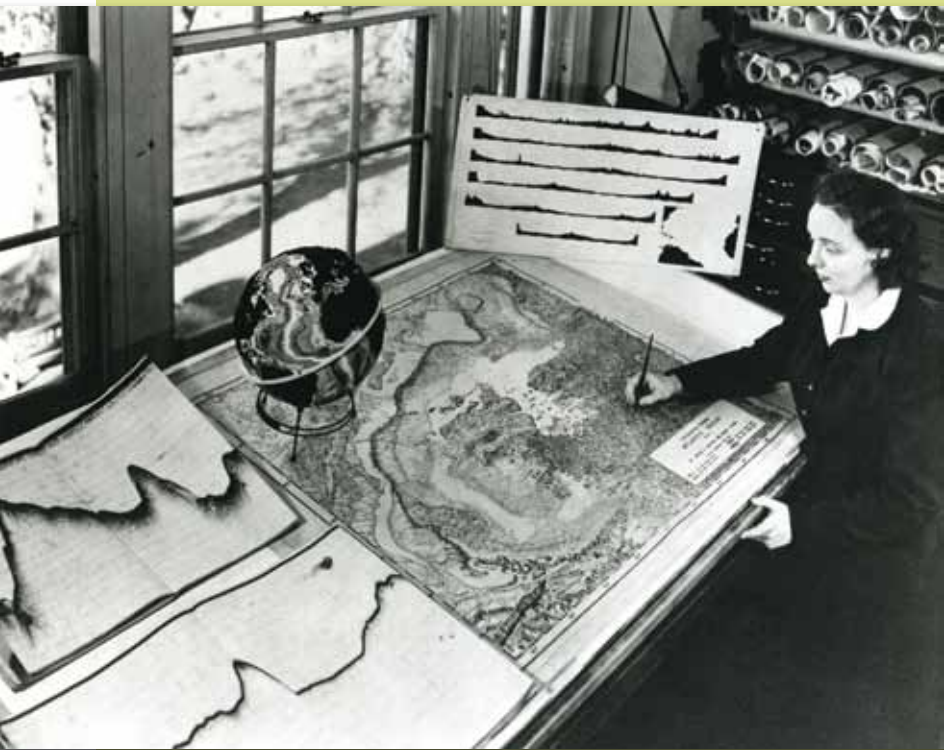
Top: Marie Tharp in her drafting room

In conjunction with the exhibition, the University of South Carolina will host a conference, "The Public History of Science and Technology" Sept. 11–14, 2011. The conference includes an opening reception at McKissick Museum on Sunday, Sept. 11, from 4 to 6 p.m. To learn more and register for the conference, please visit www.cas.sc.edu/hist/conf/phst/index.html .