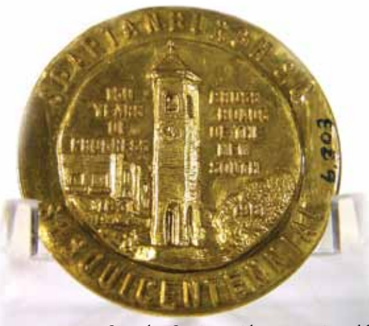
Spartanburg Sesquicentennial commemorative medal