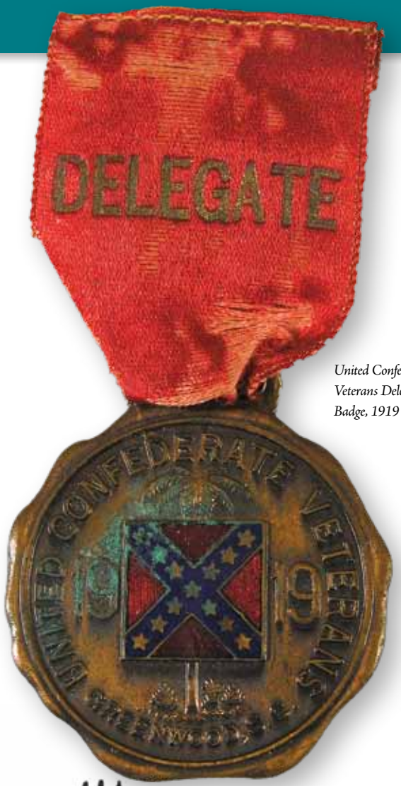
United Confederate Veterans Delegate Badge, 1919

Juxtaposing the words “mettle” and “metal,” McKissick curators have mined the collection for a cross-section of metal objects that symbolize a person’s character. Showing Your Mettle invites visitors to see some of the museum’s hidden treasures while also considering how these objects are tied to a person’s identity. Featured objects include a Civil War mess kit, silver tea canister, dueling pistols, ceremonial swords, political memorabilia, coinage, awards, and medals cast in gold, silver, bronze and brass. The exhibition raises questions like “What kind of people owned or used these objects?” and “What do they say about the individual?” Visitors are encouraged to leave comments as to how they show their mettle, whether it be through materials collected for personal adornment or visual display.