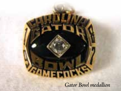
Gator Bowl medallion