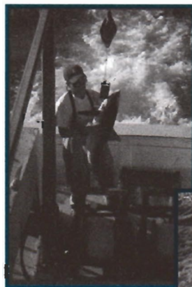
The weight of each blacknose shark collected was recorded. Sampling was conducted from onboard the RV Anita , captained by Paul Tucker.

Direct ageing is the most widely preferred method of age determination because age estimates are based on individual fish. This method of age determination relies on counting growth increments visible in hard parts such as spines, scales, bones, and otoliths.