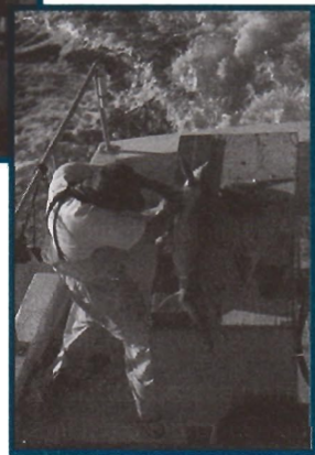
After measuring the shark's length, its reproductive status and stomach contents are assessed.