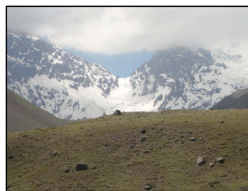
The Natural Landscape of Somewhere in the World

Your state Geographic Alliance is one of the best education programs of its type in the United States. Are you taking advantage of this resource?