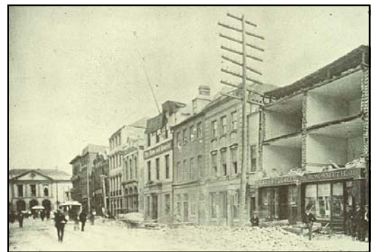
Damage resulting from the 1886 Charleston earthquake. More than 60 persons were killed.

The Alliance, via grant funding from FEMA and the SC Emergency Management Division, will conduct two workshops in 2012 titled “Earthquakes in South Carolina: Bridging the Social and Science Divide for K-12 Educators.” Look for dates and workshop locations when they are announced later this Spring.