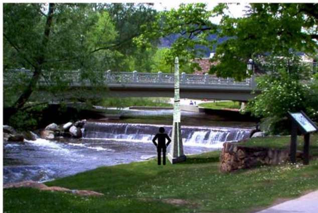
Approved location, showing relative size of marker

This area is at the nexus of a major transportation corridor, and the major floodway in Boulder. It is also at the apex of the area where the greatest flood damage will occur in Boulder. This high traffic area provides an excellent opportunity to educate large numbers of people.