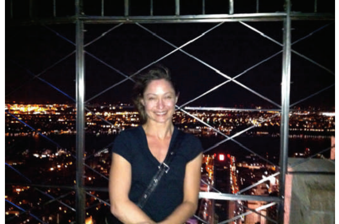
Midnight viewing of city.