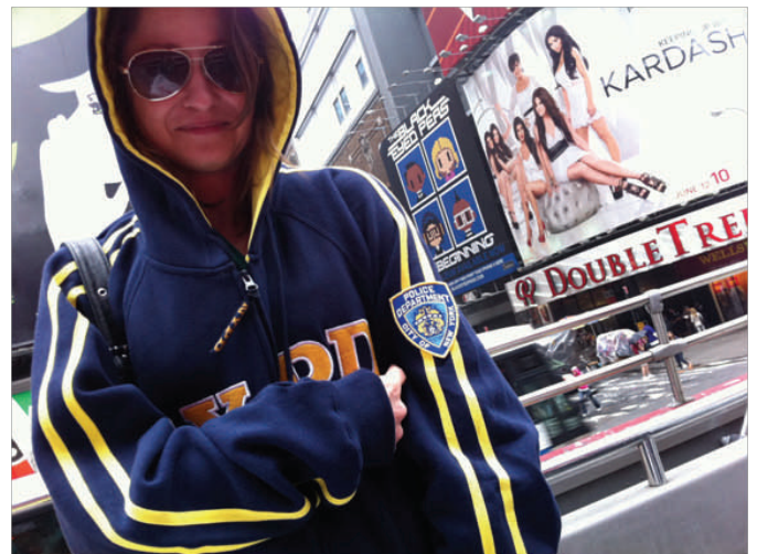
The double decker bus tour, just before rain begins.