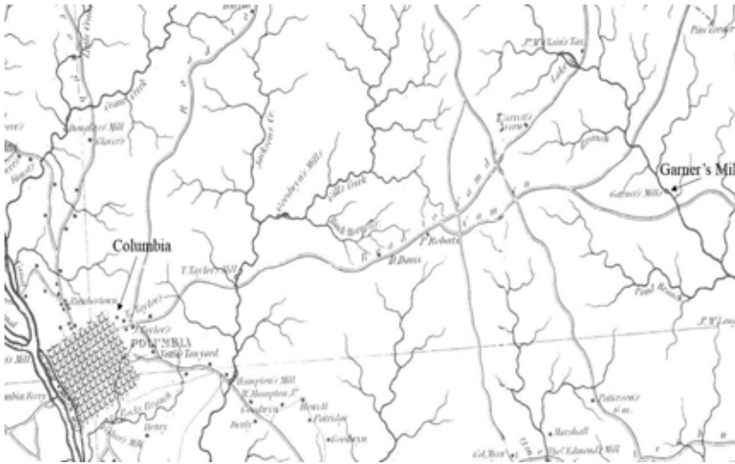
Fig. 2: Location of Garner's Mill on Mills' Atlas.

detector survey of part of the site, and mapping and recording of the intact timber remains of the mill dam. Archival research was also undertaken to create a chain of ownership for the mill.