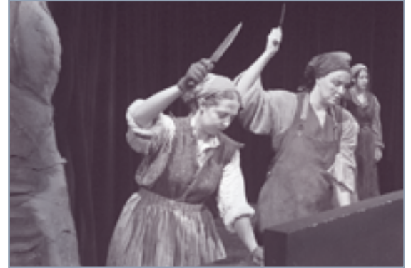
A moment from Gut Girls , the inaugural production in the Department's new Black Box theatre

After this I directed a production of The Vagina Monologues in support of the Violence Prevention Against Women Day and Events. I also directed a late night at the local Trustus Theatre called